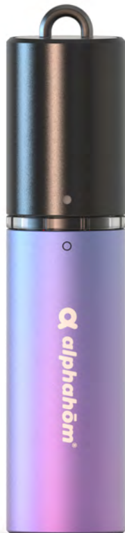
Aurora USD $42.99